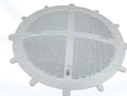
Drainsafe DS 360